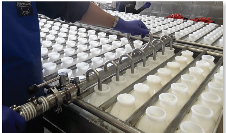
Available for any size trailer. Stainless steel valve included.