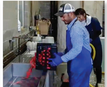
Bottle Crates that will hold either 9 or 12 bottles. Also great for transporting and storing nipples.