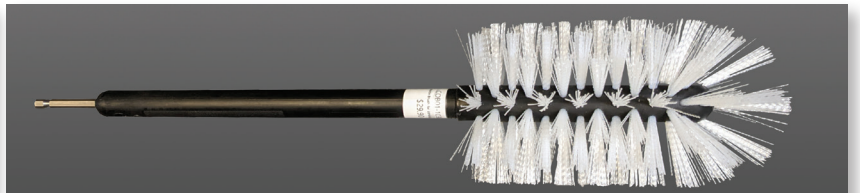
Heavy duty bottle brushes with drill adapters. White-stiff bristles, Green-soft bristles. 18" long.