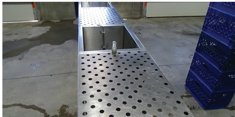
Stainless Steel Drain Tables available in: 36 and 48" lengths by 24" widths