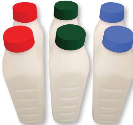
Red, Green and Blue Caps