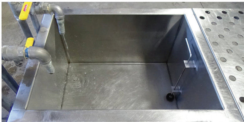
Stainless Steel Rinse Sinks available in: 30, 96, 120 and 144" lengths by 24" widths