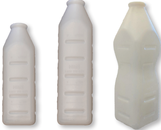
HMI 2 QT, 3 QT and 4 QT Bottles. The heaviest in the industry

Tired of bottles that collapse? Try Ours!