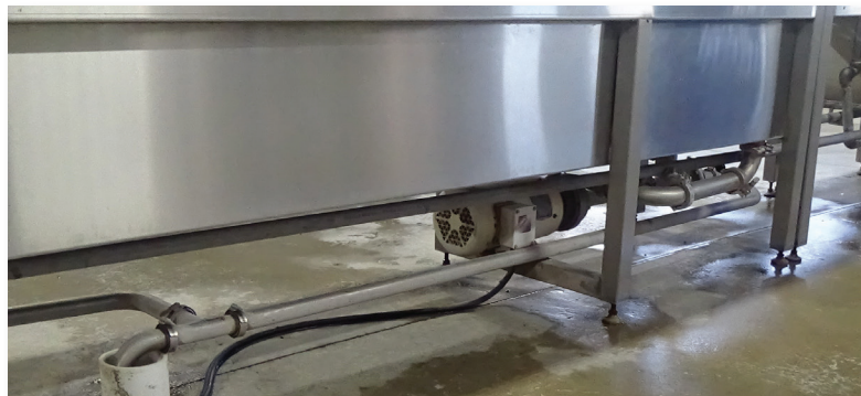
Stainless Steel Nipple Wash Basin with power agitation system available in: 48, 72, 96, 120 and 144" lengths by 24" widths